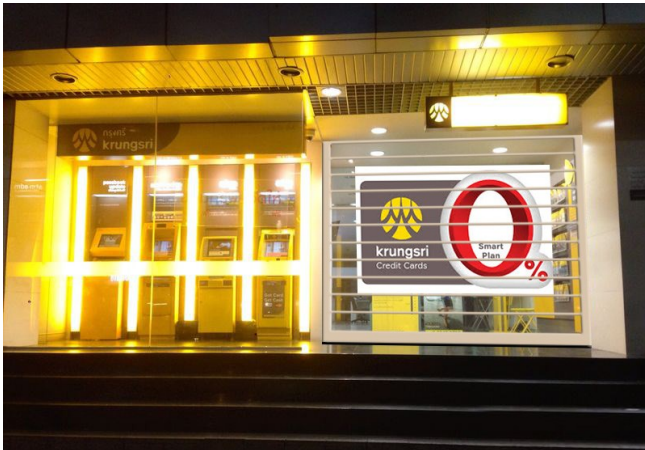
High security 6mm solid polycarbonate panels

Media Shutter© from Firlane is a high security shop-front roller shutter. It is simultaneously a full sized electronic screen that you can use to promote products and services out of hours. With its dual usage Firlane System's Media Shutter© is incredibly cost effective. High Security polycarbonate roller shutters designed to protect stores after hours are transformed into billboards for stunning visual advertising, including full HD video. Some retailers advertise their suppliers' products, generating additional revenue directly from the sale of space.